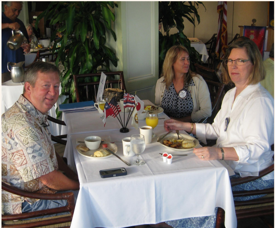
The Writers' Group.